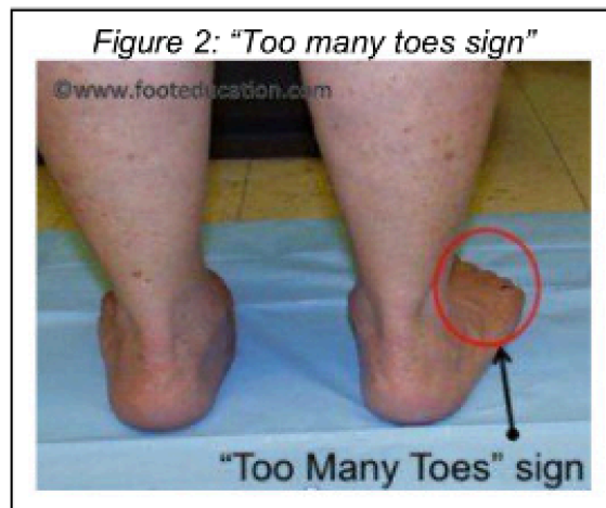
Figure 2: “Too many toes sign”

Posterior tibial tendon dysfunction may affect the patient's walking, as the patient's dysfunctional posterior tibial tendon can no longer stabilize the arch of the foot when weight is placed on it. There is often tenderness to touch and swelling over the inside of the ankle just below the bony prominence (the medial malleolus). There may also be pain in the outside aspect of the ankle with palpation. This pain originates from impingement or compression of two tendons between the outside ankle bone (fibula) and the heel bone, (calcaneus) when the patient is standing.