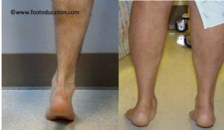
Figure 3: Ability to do a single leg heel rise (left picture); Inability to do a single leg heel rise (right picture)