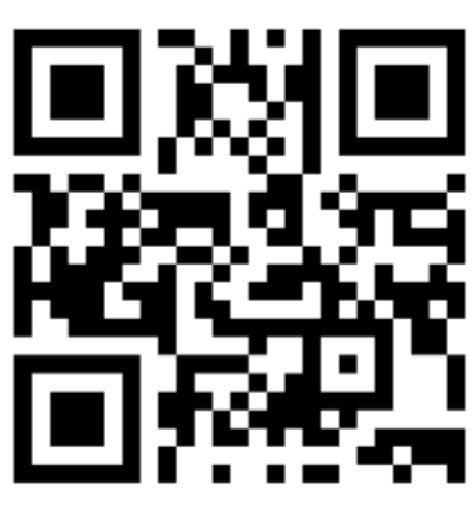
Or use QR code