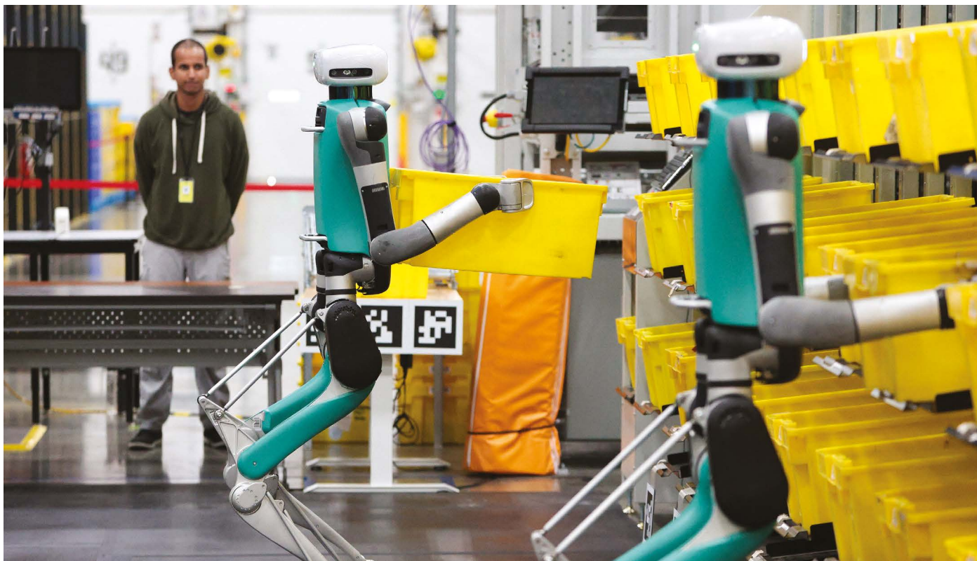
Bipedal robots at Amazon's Robotics Research and Development Hub in Sumner, Washington.