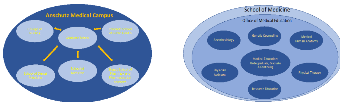
Figure 1: Left: Four AMC schools and one college partner with a sixth AMC school - the GS – to accomplish their educational missions. ORE PhD students are members of the larger AMC graduate student community that includes Masters, Doctorate and Doctoral students from all AMC schools. Right: The ORE PhD programs are administratively located within the Office of Research Education, located in the SOM’s OME. OME is the administrative home of the SOM educational programs.

For GS-affiliated programs the relevant administrative responsibilities are divided between the home School or Office, in this case SOM-ORE, and the GS. This handbook follows the agreement reached between the SOM-ORE and the GS regarding distribution of academic responsibilities.