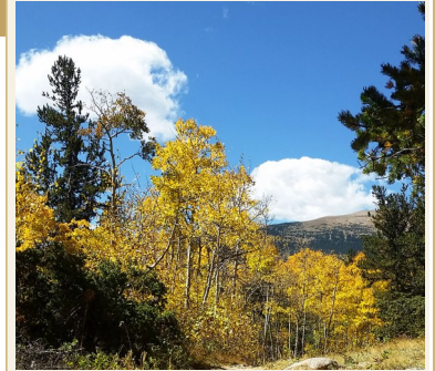
South of Fairplay

The iconic view of Maroon Bells in White River national Forest near Aspen is one of the most beautiful sites to visit in the state. Many popular trails in the area