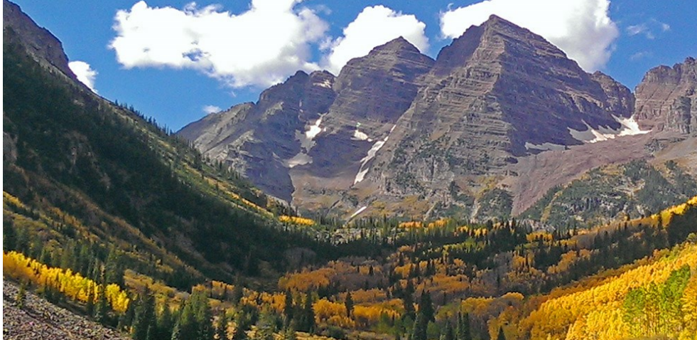
Photo: Maroon Bells

Autumn is upon us and it's a great time to plan a hike, walk, or drive to see the fall colors. Hiking and walking can be low impact and the movement is good for joints and muscles. Our NHF Chapter in Colorado regularly hosts hikes to inspire and challenge through their Backpacks and Bleeders program. We're lucky to live in a region where there are many opportunities to see this colorful change of season in all its glory. Whether it's a walk in your neighborhood or a road trip to take in the views, grab your shoes and sunscreen and enjoy the colors before they fade. We asked around at the HTC and came up with a list of our favorite family-friendly hikes to enjoy at this lovely time of year. Be sure to check in advance for trail conditions, weather, and prepare for emergencies.