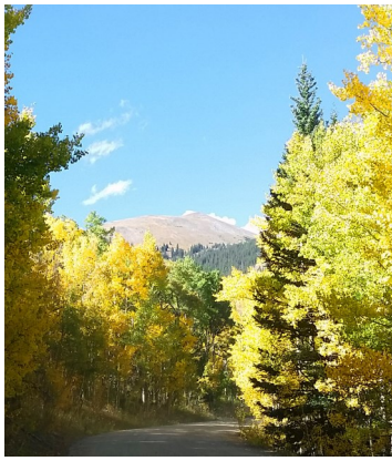
Photo: On Boreas Pass