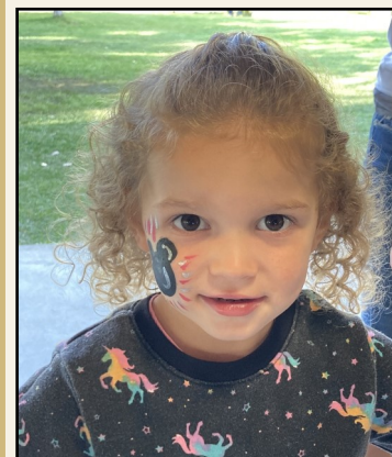
Thanks to all who participated in the 2021 Unite for Bleeding Disorders Walks!