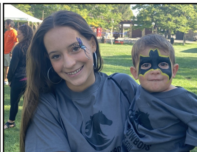
A few photos of families who attended the RMHBDA Unite for Bleeding Disorders Walk in Billings, MT.