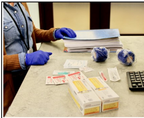
Talia Garramone puts together an order for a patient to be shipped. Our team always use strict protocols to make sure all our orders are both correct and properly cared for at all stages of preparation.

Unlike other specialty pharmacies, the HTC Pharmacy only fills prescriptions for bleeding disorders. Bleeding disorders are the HTC Pharmacy's one and only focus—we are experts in bleeding disorder medications. The HTC Pharmacy is also unique in that we are a part of the HTC team and work side by side with our providers, nurses, physical therapists, and psychosocial team to help patients find the right medication and care they need.