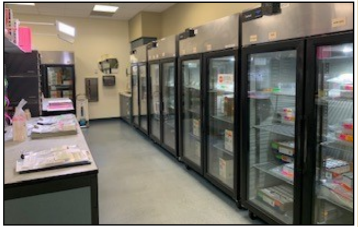
The HTC Pharmacy has specialized equipment, including multiple refrigerators that are strictly monitored for product safety.

If you would like to fill with our HTC Pharmacy or have questions about your health plan and if it is eligible to fill with the HTC Pharmacy, please call our pharmacy team. We