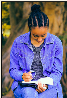
Keeping a gratitude journal and writing thank you notes are wonderful ways to express gratitude.

Expressing gratitude to others by a handwritten note in the mail, a kind e-mail, or a friendly text can mean the world to someone. And the act of pondering your gratitude to that person, writing it out, and sending it out can nurture your own happiness as well as strengthen your relationship with that person. Studies have found that writing a note can lift your spirits and those of the one you send it to, it's a win-win!