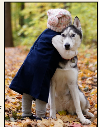
Hugging those you love is a great way to express gratitude, and once the pandemic eases, hugging can be back on your bucket list!

We may be unable to visit with friends and family, but technology allows us to call, chat, text, video call, and email one another with ease. Take the time to call someone you care about and regularly express your gratitude to them. The moments where you can share these feelings of gratitude can build your relationship and reinforce your focus on the good things in your life. Take time today to improve your health with an attitude of gratitude!