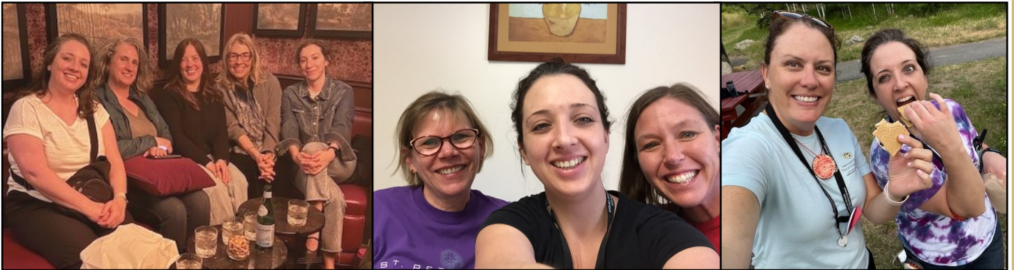
Our nurses travel to conferences (above left), take selfies (center), and even love eating s’mores (right).

They are all skilled in providing for the needs of our patients and spend many hours improving the lives of patients with bleeding and clotting disorders. We are so grateful for our nursing team and wish each of them a Happy Nurses Month! Thank you for all you do all year long! Don’t forget that you can share a great experience with any of our nurses by using our Drops of Love program (below).