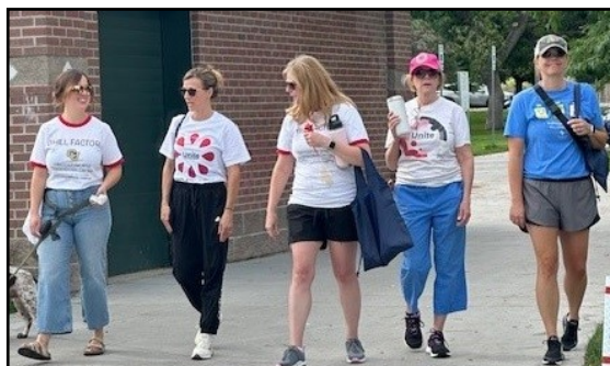
You may find our nurses attending education events, camp, and the Unite for Bleeding Disorders Walk (above).