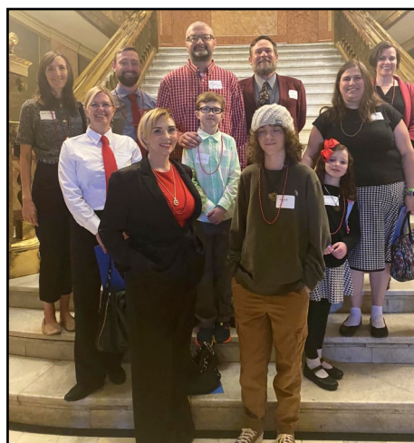
NBDF volunteers visited the Colorado State Capitol to advocate for families with bleeding disorders.