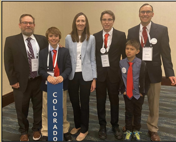
Some of the volunteer advocates who attended Washington Days in Washington DC to share their experiences with legislators this month.