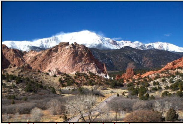
Pikes Peak from Garden of the Gods, Colorado Springs.

Our HTC staff regularly visits areas in our region to allow patients to schedule their annual comprehensive visits at a closer location to their homes. These outreach clinics offer the hands on expertise of our doctors, nurses, physical therapists, researchers, pharmacists, and social worker to those who live in or near such places as Grand Junction and Colorado Springs, Colorado, and Billings, Montana.