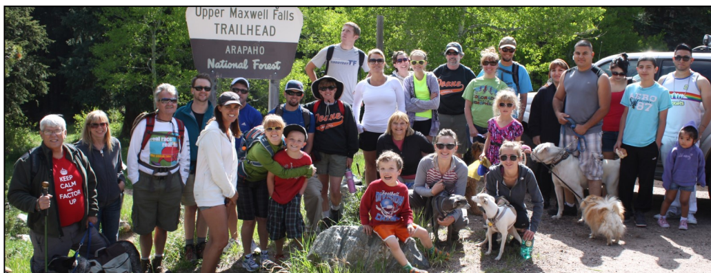
Backpacks + Bleeders out on a hiking adventure.

Summer is here and with it is the chance to get outdoors for fun activities. For those in the bleeding disorder community, it may seem daunting or out of reach to hike or try new activities. If you've ever wondered if you could hike a 14er (14,000+ foot mountain) or just wanted to hike more but weren't sure how to get started with a bleeding disorder, look no further than Backpacks + Bleeders.