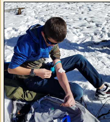
Infusing on an activity.