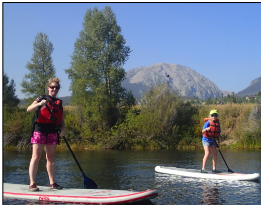
Stand up Paddle Boarding activity last year.

They welcome ALL physical ability levels, including those using crutches and wheelchairs, and all ages are welcome. The group advocates prophylaxis adherence and consistent, direct communication with the HTC to prepare and stay healthy while enjoying fun activities.