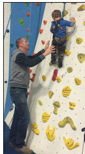
Indoor rock climbing activity.

Already this year they've hosted hikes in various parts of Colorado and just hosted stand up paddle boarding in Colorado Springs. Coming up is a family hike outside Fort Collins on July 7th, their ADA/Wheelchair accessible hike at Garden of the Gods on August 11th, and their annual 14er hike on August 21st. This year they're hosting their first ever overnight father/son camping trip in September and are working to get a firm date for their fishing trip. Backpacks + Bleeders loves sharing moments of accomplishment with so many of our community. Seeing family members crest the top of a difficult hike or teaching people with fused joints how to do something they never thought possible is a joy. Please don't let a bleeding disorder stop you from doing some of these great activities. Backpacks + Bleeders is here to help! Their mission statement and social media hashtags say it all: Cultivating adaptable independence one meaningful adventure at a time. #WeClimbMountains #getoutside #playitsmart #adventure