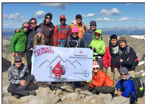
Hiking a 14er.