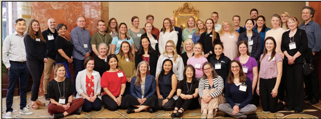
Physical therapists, members of the Hemophilia Alliance, and HTC staff met May 15-17, 2024 for the First Annual Hemophilia Alliance Physical Therapy CE Conference. The group gathered at the Brown Palace for a meet and greet during the conference.

In May, The Hemophilia Alliance, in collaboration with our HTC, hosted their First Annual Physical Therapy CE Conference. This was a gathering of over forty physical therapists from HTCs around the country to learn and connect with others who treat bleeding disorder patients. In fact, we had HTC physical therapists from every region of the United States in attendance. CE stands for Continuing Education, which means this was a conference that allowed physical therapists to gain credit for their learning. The two-day conference was held in downtown Denver at the Brown Palace the first day, and at our center the second day. It was an opportunity to learn from experts as they presented the latest innovations in physical therapy for the bleeding disorder community.