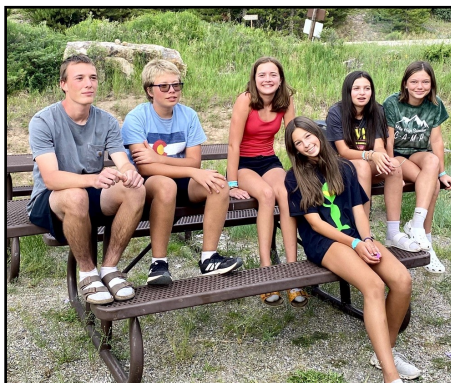
Teen campers on their Teen Leadership camping adventure.