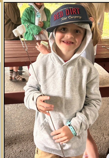
Nothing goes together like camp and s'mores! Mile High Summer Camp this July was great fun!