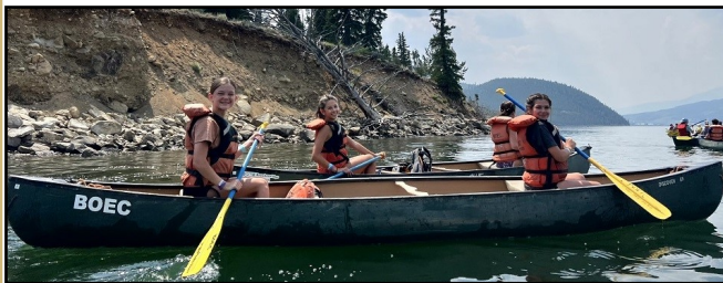
Kayaking was a part of this year's BOAC adventure for our older teen campers.

Our staff shared that we had several amazing successes during infusion education, and of course the fantastic opportunity for fun, friendship, and enjoying the mountains. Our nurses teach and administer infusions during camp, and many campers learn to infuse while there. Older campers often act as mentors to provide support through the process. Our Social Work team created several activities around being kind this year; challenging kids to do acts of kindness and of course, winning prizes.