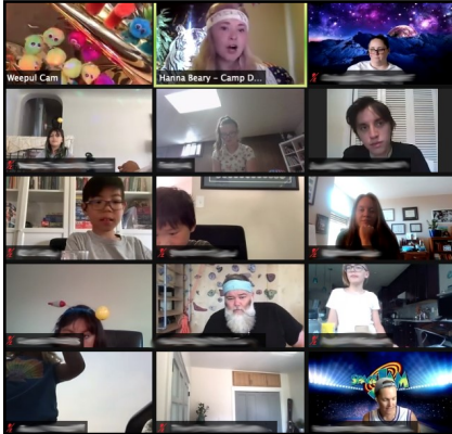
Mile High Summer Camp was held in a three day virtual event.

With the COVID-19 pandemic still causing significant disruptions in most of our lives, NHF Colorado held a hybrid of fun events in July to support our summer camp kids and bleeding disorder families. To keep our families safe, we held Mile High Summer Camp in a three-day virtual format this year.