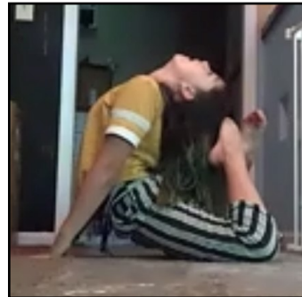
Campers shared talents, creations, and fun games.

Find us on Facebook, Twitter, and our website for frequent updates on news and events.