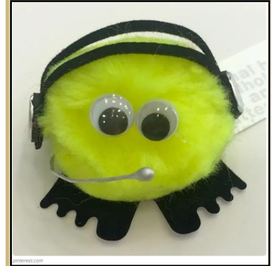
Were you there for the weepuls!? 2021 Camp was filled with fun!

To register or find out more information on any of these upcoming events and other future events not listed, please go to the websites for NHF Colorado or RMHBDA .