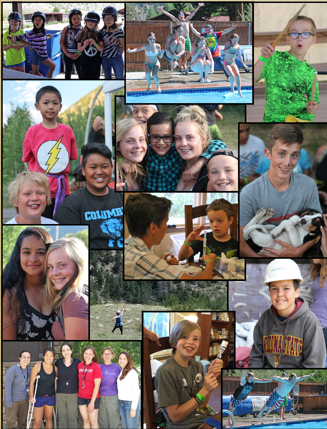
All photos cover and page 3 courtesy NHF Colorado-Bethany McCabe and HTC-Merilee Ashton. See a slideshow of these and many others at our website at www.medschool.ucdenver.edu/htc find the COMMUNITY tab at the top and click on CAMP .