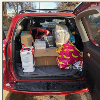
One of our staff member's car stuffed with items to help at the Comitis Crisis Center.

This stream of personal donations from our staff made a big difference to those housing at Comitis, and they warmly welcomed our support.