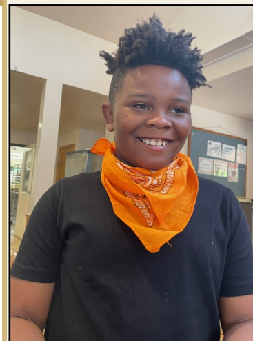
Mile High Summer Camp was held in late July up at Easterseals Rocky Mountain Village in Empire, Colorado.

We are grateful for all the support from our HTC staff and NHF Colorado to make Mile High Summer Camp a wonderful experience. A few pictures from camp are on page 3; these and other pictures from camp can be found at our website camp page here: https://medschool.cuanschutz.edu/hemophilia-thrombosis/resources/bleeding-disorders/camp Scroll down to see photos from 2023 and 2022. For more information about Mile High Summer Camp and what NHF Colorado offers, go to cohem.org .