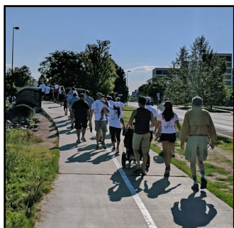
Walkers make their way around Sloan's Lake in 2017.

NHF Colorado will have a camper reunion area that is just for our campers to reconnect, hang out, and enjoy donuts together. Precautions will be in place to keep things as distanced and sanitized as possible. For those who want to participate virtually, you can check in with NHF Colorado on their Facebook page for a livestream broadcast. More details and maps to parking are available at the NHF Colorado website (scroll to the bottom for maps).