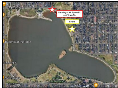
Meet us at our new location at Sloan's Lake on the northeast side this year!

This year you are welcome to join us virtually as well as in person! The Denver walk has a new location for 2021! The walk is still at Sloan's Lake but because of some construction we are meeting at the northeast side, also called the North Central Area. This is located near 22nd Street and Stuart Street. Parking for general participants is available along West Byron Place between Vrain Street and Stuart Street on the north side of the lake, or you can park in the neighborhoods surrounding the walk site. VIP parking for Elite Grand Champions is located right near the start at 22nd and Stuart. Check out the cohemo.org website for details on how to become a VIP!