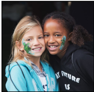
The Billings Montana Walk will be on Sept 11th at Zoo Montana.

Can you join us for a walk!? It's almost time for the Unite for Bleeding Disorder Walks once again! The NHF Colorado chapter is hosting their annual Unite for Bleeding Disorders Walk on Saturday, August 28th at Sloan's Lake Park . Check-in begins at 8 am and the walk starts at 9 am. This walk is vital to help the chapter fund the many activities and educational programs throughout the year, including camp. While the pandemic has put a damper on many things in the past year or so, NHF Colorado continues to reach out to families in the bleeding disorder community and strives to offer support.