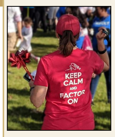
Keep calm and walk with us!

Take a step and make a difference despite all 2020 has thrown at us! For more information about this event, go to <u>cohemo.org</u>.