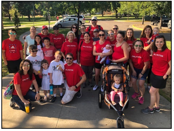
We may not be able to walk like last year but all of us can still UNITE to support those with bleeding disorders.