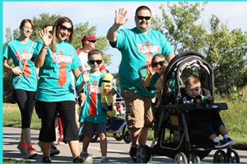
All proceeds go to NHF Colorado, funding programs for the bleeding disorder community.