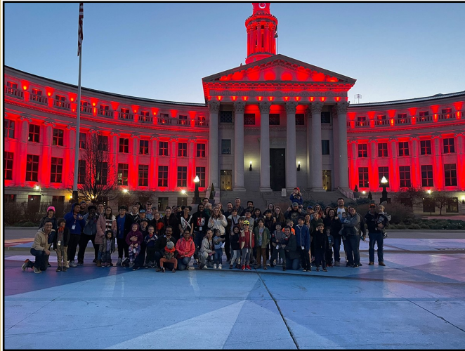
Many of those attending Education Days in 2023 were able to go downtown to see the Denver City and County Building lit up red in honor of those with bleeding disorders.

NHF Colorado and the HTC joined forces in April to support NHF Colorado Education Days. This annual gathering allows families with bleeding disorders to connect, learn, and support one another. Our HTC staff was very happy to have been able to participate and help our bleeding disorder families in this fun and engaging event.