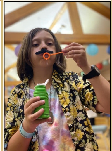
Mile High Summer Camp is full of fun, creativity, even bubbles!