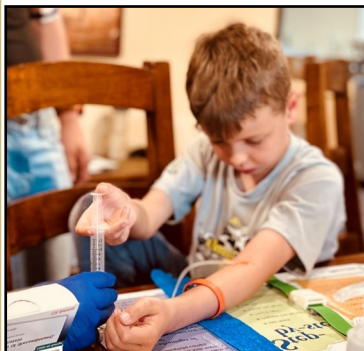
Learning and practicing self-infusion is a milestone that many of our campers work on during camp with the help of our medical staff.

This fun-filled camp is a great opportunity for kids with a bleeding disorder to learn, make new friends, and take steps toward independence. Mile High Summer Camp gives kids with a bleeding disorder the chance to try new things and have a lot of fun in a safe environment. Our HTC provides nurses, pharmacists, social workers, physical therapists, and physicians on site to teach and provide medical support throughout the week. Kids attending can participate in crafts, swimming, zipline, fishing, creative activities like skits and songs, as well as classes to help them learn.