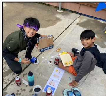
Cultivating creativity and a chance to relax is a big part of Camp.

Registration is now open , and space is filling up fast. Go to co.bleeding.org , or contact Anna Cheshire at acheshire@bleeding.org for more information, or go to their registration page directly at https://hemophilia.campbrainregistration.com/ .