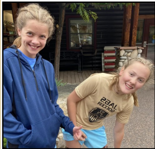
Camp is all about fun, friendships, and learning together.

Every summer the Colorado Chapter of the National Bleeding Disorders Foundation (NBDF), and our HTC work together to plan and run a week-long summer camp for children with a bleeding disorder. Mile High Summer Camp is held at Easterseals Rocky Mountain Village in Empire, Colorado, and this year will be from July 13-17, 2025 .