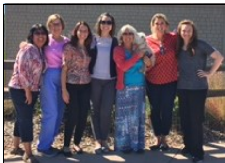
Outreach Clinic Grand Junction, CO in 2015

The HTC staff regularly visits areas in our region to allow patients to schedule their annual comprehensive visits at a closer location to their homes. Our staff recently developed a test clinic for those patients living near Colorado Springs, and it was a success!