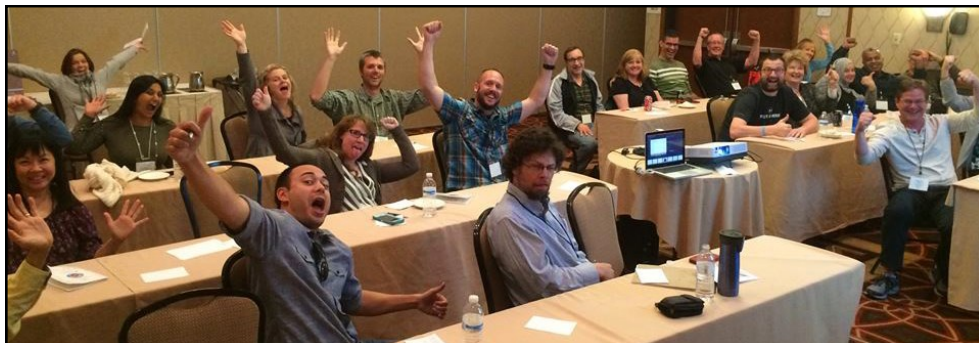
Patients and families participating in a class on advocacy at Education Dayz.