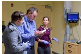
CHA/PA Students at the CAPE