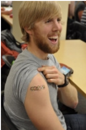
Injection Workshop for 2nd Year Students