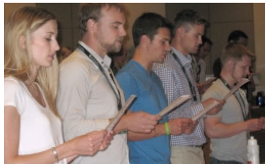
Class of 2015 Students

The Class of 2015 were welcomed to campus on May 31st and participated in their Matriculation Ceremony on June 4th. The class is represented by a variety of students, some of whom completed their undergraduate degrees within the last few years, while others have chosen a career change after years in the workforce. We have both Colorado residents and students from a range of states from Vermont to Texas to California to Alaska!