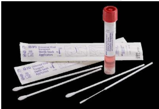
Examples of swabs and viral transport media

1 tube of M6 or M4-RT viral transport media