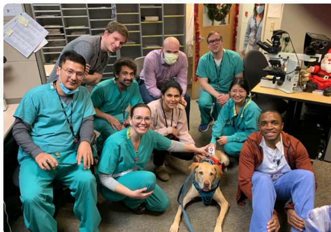
Therapy dog Yoko with the residents!