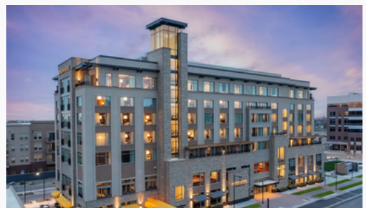
The Benson Hotel & Faculty Club