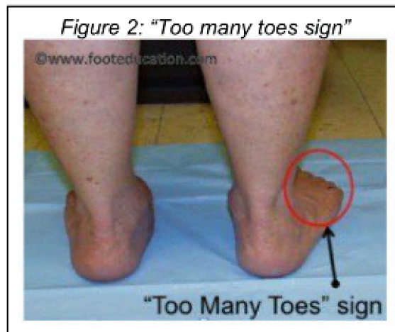
Figure 2: “Too many toes sign”

Posterior tibial tendon dysfunction may affect the patient's walking, as the patient's dysfunctional posterior tibial tendon can no longer stabilize the arch of the foot when weight is placed on it. There is often tenderness to touch and swelling over the inside of the ankle just below the bony prominence (the medial malleolus). There may also be pain in the outside aspect of the ankle with palpation. This pain originates from impingement or compression of two tendons between the outside ankle bone (fibula) and the heel bone, (calcaneus) when the patient is standing.