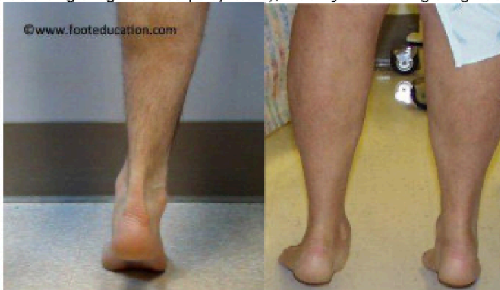
Figure 3: Ability to do a single leg heel rise (left picture); Inability to do a single leg heel rise (right picture)