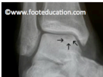
Figure 2: Medial Talar OLT on plain X-Rays