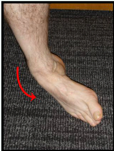
Figure 1: Mechanism of Injury

Bracing (such as an ankle stirrup or ankle lacer) when returning to "high risk" activities.