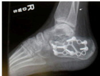
Figure 3: Post surgery

Bone fragments are systematically reduced to their original position and then fixed with screws and plates (Figure 3). The subtalar joint is also reconstructed to its previous state. Post-surgery: Ice, elevate, pain medication, early motion, non-weight-bearing x 8-12 wks