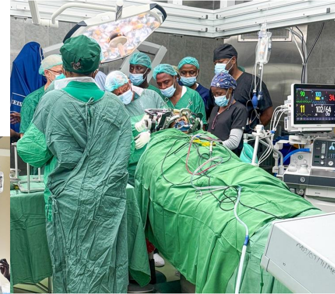
Top right: Stereotactic frame placement for biopsy