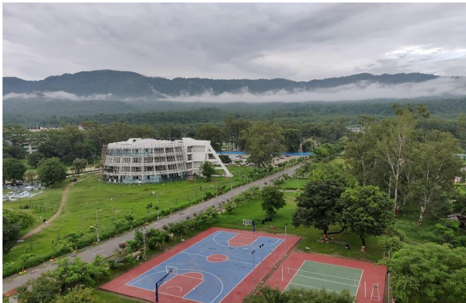
Aerial view of the campus

The campus houses basketball, volleyball, tennis and badminton courts and cricket and football ground.