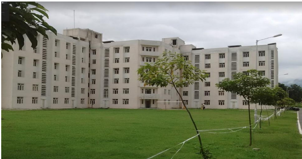
AIIMS Rishikesh Hostel

Hostels are available to rotating learners in campus. The campus is green, calm and quiet. Hostels are provided with mess facilities. Cafeteria is available in Hospital campus with 24 hour facility of wide range of meals. The meals are hygienic, nutritious and vegetarian.