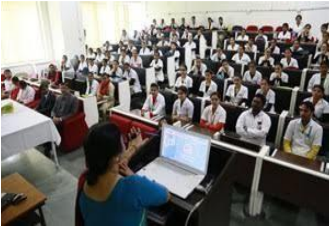
Fully equipped smart classrooms

The Institute will create an excellent academic and educational milieu for providing a platform for development of quality training and research. Other objectives are to achieve an epitome of quality in medical education delivery and training system and to render international standard quality patient care and health care development system.