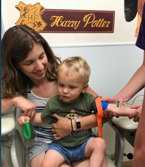
ASK Screening at 2 years