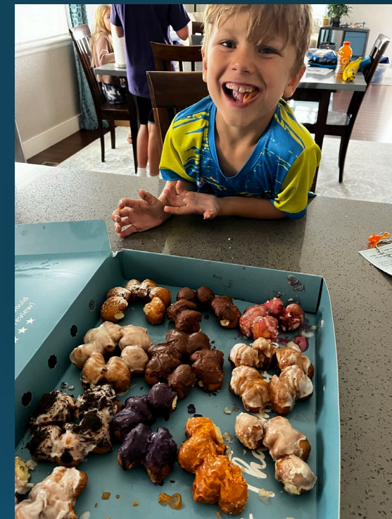
Finally found Mochi Thai'm Donuts!