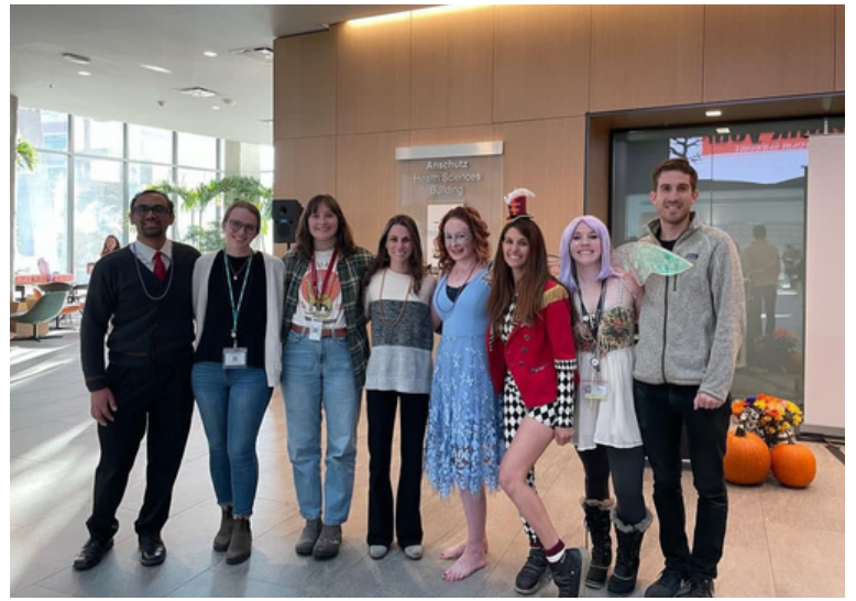
The planning team and event speakers pose for a photo during the inaugural event.

EXPOSUREPALOOZA raised $13,000 in support of the OCD program and we are looking forward to even bigger and better future events!