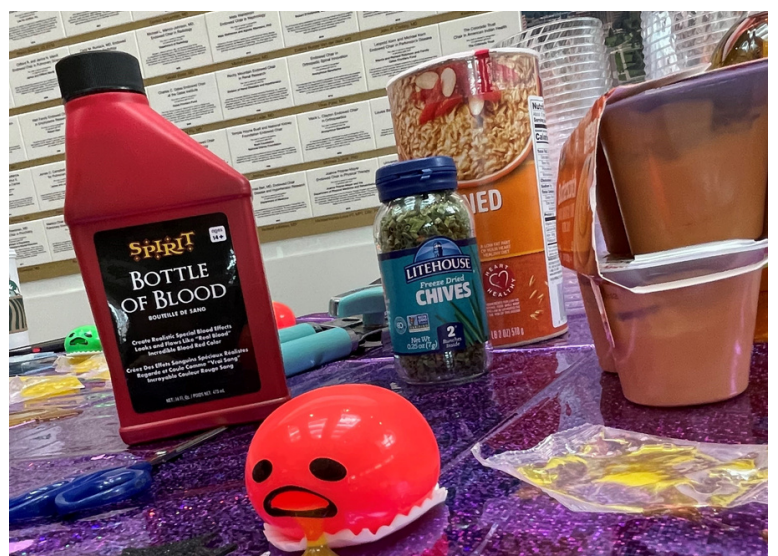
Exposure booths set up to allow attendees to face their fears

THE LONELINESS AND SENSE OF DYSFUNCTION THAT I OFTEN FEEL, WAS SMALLER FOR A TIME... I'M PROUD OF MYSELF FOR ACTUALLY GOING AND ENGAGING IN EXPOSUREPALOOZA.