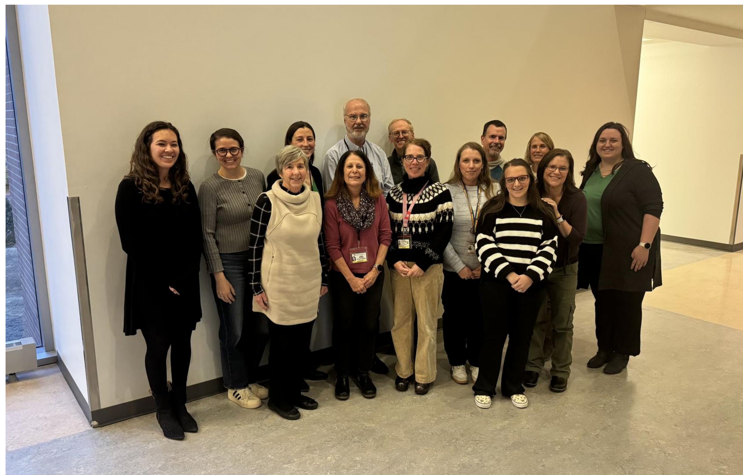
Pictured: CAMPHIRE team members (partial group shown)

Building and sustaining genuine engagement with practices, communities and patients is essential to building practice-based research that responds to the preferences and needs of communities. This presentation will describe tools for successful engagement of practices and communities using examples from the recent NIH CARE for Health Initiative-funded hubs and from ongoing practices at the WWAMI region Practice and Research Network.