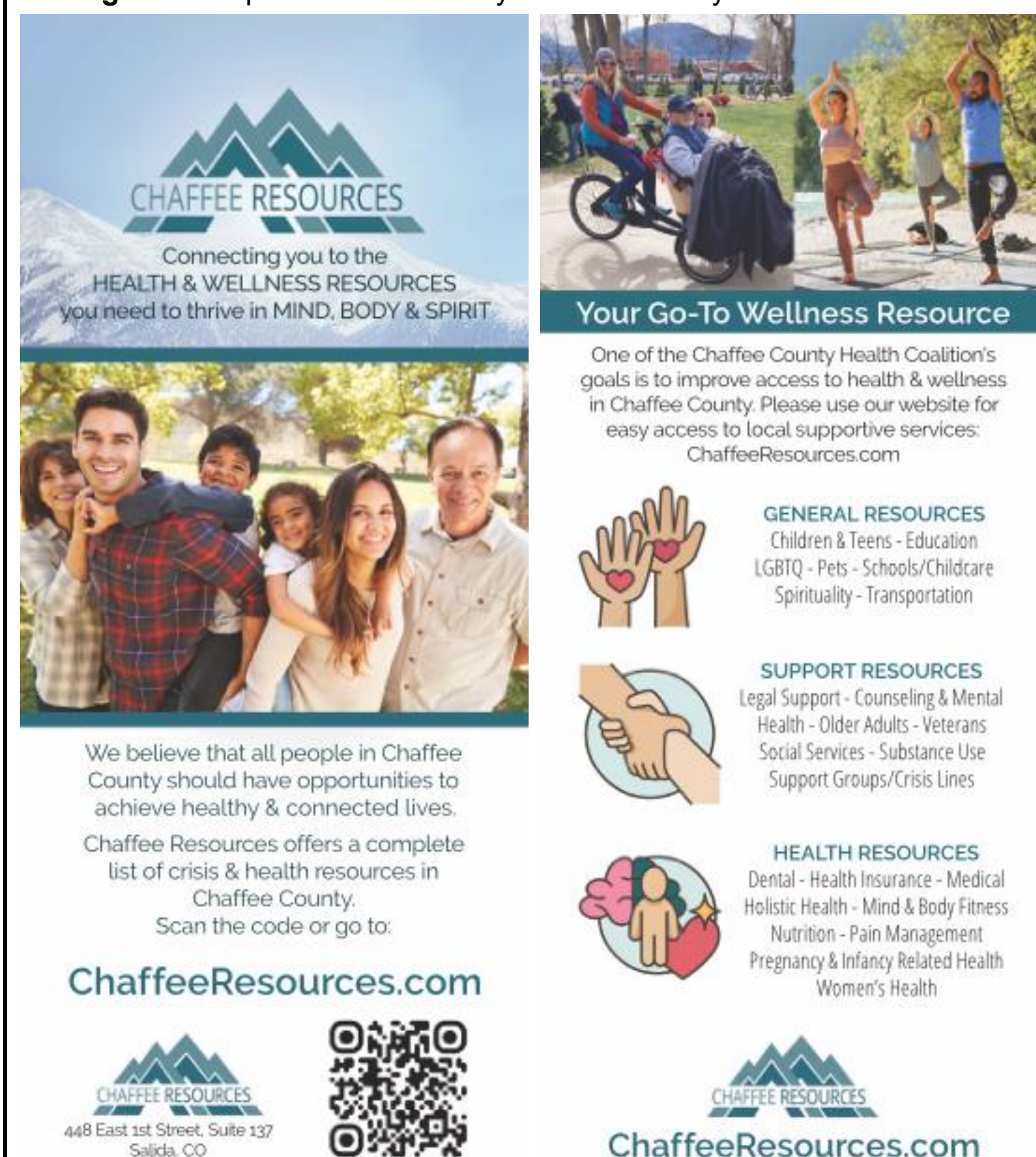
Figure 4: Chaffee Resources flyer distributed and placed in patient rooms in Salida Health Center