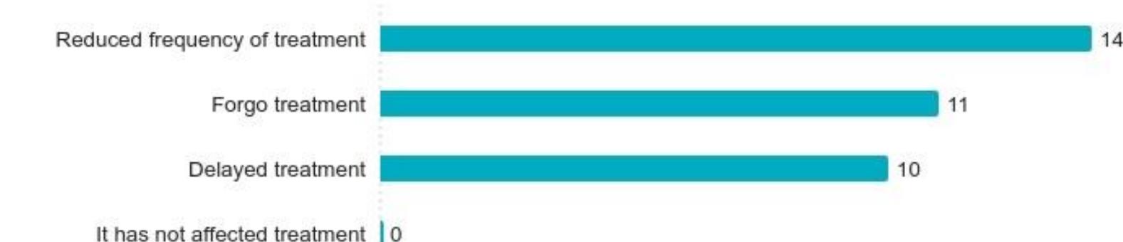
Figure 3: "How has cost of behavioral healthcare affected your patient or client's ability to seek treatment? Select all that apply."

"What strategies or improvements do you recommend to enhance access to mental health and substance use services in our community?"