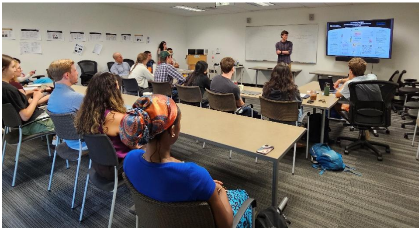
Photo: Class of 2027 students presenting Rural LIC Public & Population Health projects

The Class of 2027 students returned to campus for end-of-year activities including a clinical immersion, OSCE, simulation experiences, reflections/discussions, and CCSE exam. The students also shared their Public & Population Health Projects. The goal of the project is for students to connect with community members, investigate a public health related issue, and engage in activities to help address the issue. All of the student posters, including the top 3 as voted on by Rural Program students and faculty/staff, can be found in this Google Drive folder .