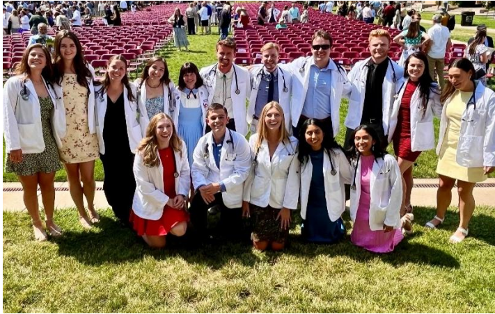
First Photo: Rural Program faculty/staff and new students during orientation