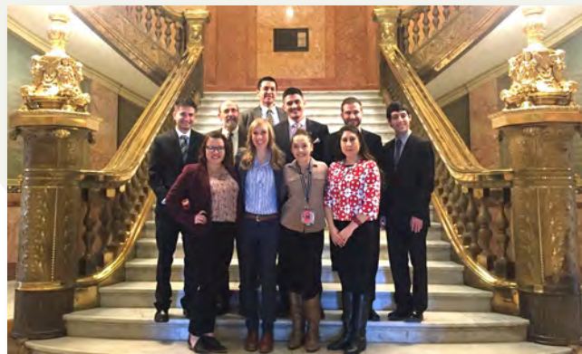
Rural Track leadership team, students, and graduates at the Colorado State Capitol for the proclamation of 'CU School of Medicine Rural Track Day.'

During the year, four current students presented with the Rural Track leadership team at the National Rural Health Association meeting. We also had ten incoming and current Rural Track students participate in Interdisciplinary Rural Immersion Week in Delta County, CO.