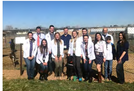
Students from MD Class of 2021 and PA Classes of 2019 and 2020 travelled to CSU to participate in joint programming with veterinary medicine students.