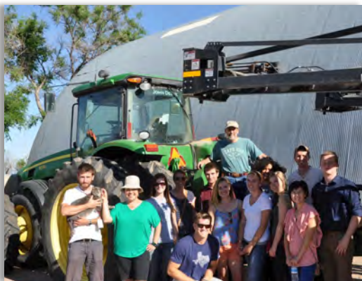
Students who participated in the 2016 Interdisciplinary Rural Immersion Week in Sterling, CO at Rooster Ranch