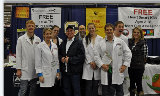
Rural Track students volunteering at the AHEC health screening booth during the 2015 National Western Stock Show

2015 was another busy year for the Rural Track! We said farewell to the graduating class and hello to a new group of students. This year's graduates matched in a variety of specialties, with 30 percent entering family medicine programs! Our first-year class includes 22 medical and four physician assistant students. Over one-third grew up in rural Colorado and several hope to return to their hometown after residency.