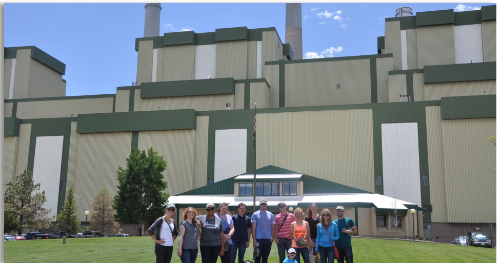
Students who participated in the Interdisciplinary Rural Immersion Week in Craig, CO at the local power plant