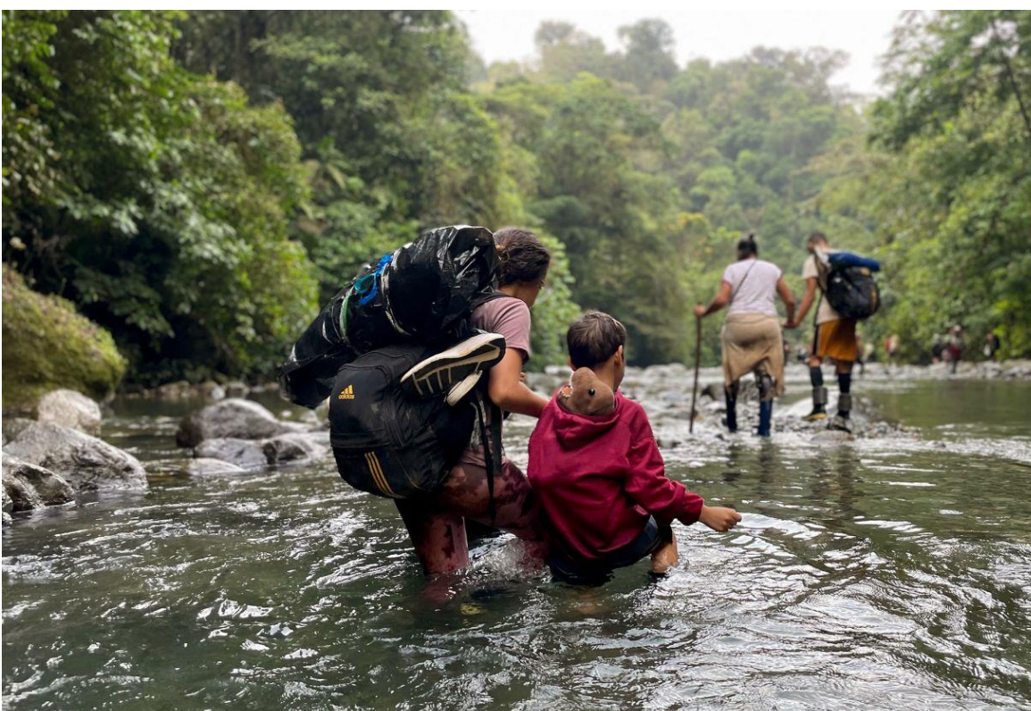
Figure 1: Family crossing a River in the Darién Gap. 1

Studies have demonstrated reproductive, obstetric, and mental health needs of Latinx immigrants. 2,3,4,5 Little research is available that describes the experience of recently-arrived migrants traversing through Central and South America using a qualitative approach. This study will address this gap of knowledge in hopes of addressing the specific mental health needs of this population.