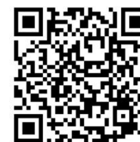
Figure 5. QR code access to published online flipbook of "Surrounded by Stories: A Collection of Communities"

As medicine increasingly recognizes the importance of relationship-centered care, programs like Senior Stories offer a sustainable, experiential model for integrating narrative practices into training. While not a requirement for graduation, this project is an opportunity for students to add humanities and humanism into their practice in a way that impacts their sense of self and their future career paths. With more formalized assessment methods and continued school and student interest, this project has the potential not only to enhance student development but also to contribute to broader efforts to address loneliness, preserve patient voice, and anchor healthcare in human connection.