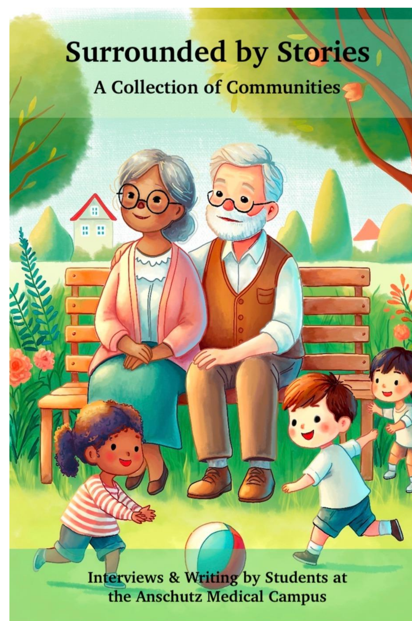
Figure 4. 2026 Senior Stories Publication cover and artwork