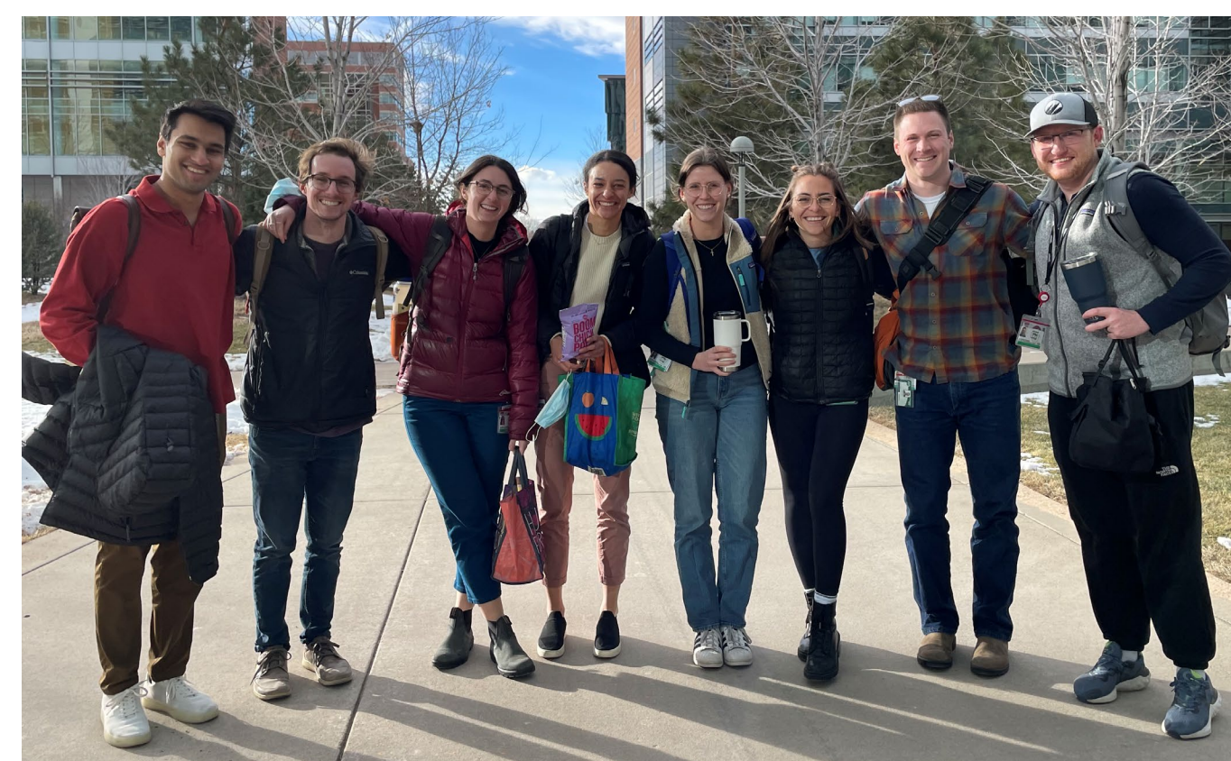
Fig. 3 FCB and AMC students pose together before a pathology lab