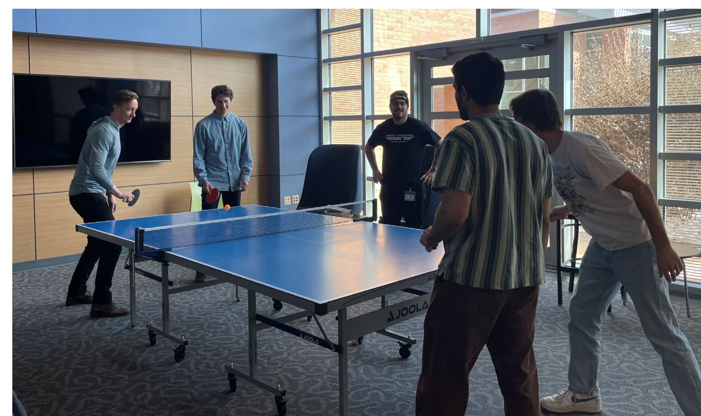
Fig. 2 FCB and AMC students play ping pong together at lunch