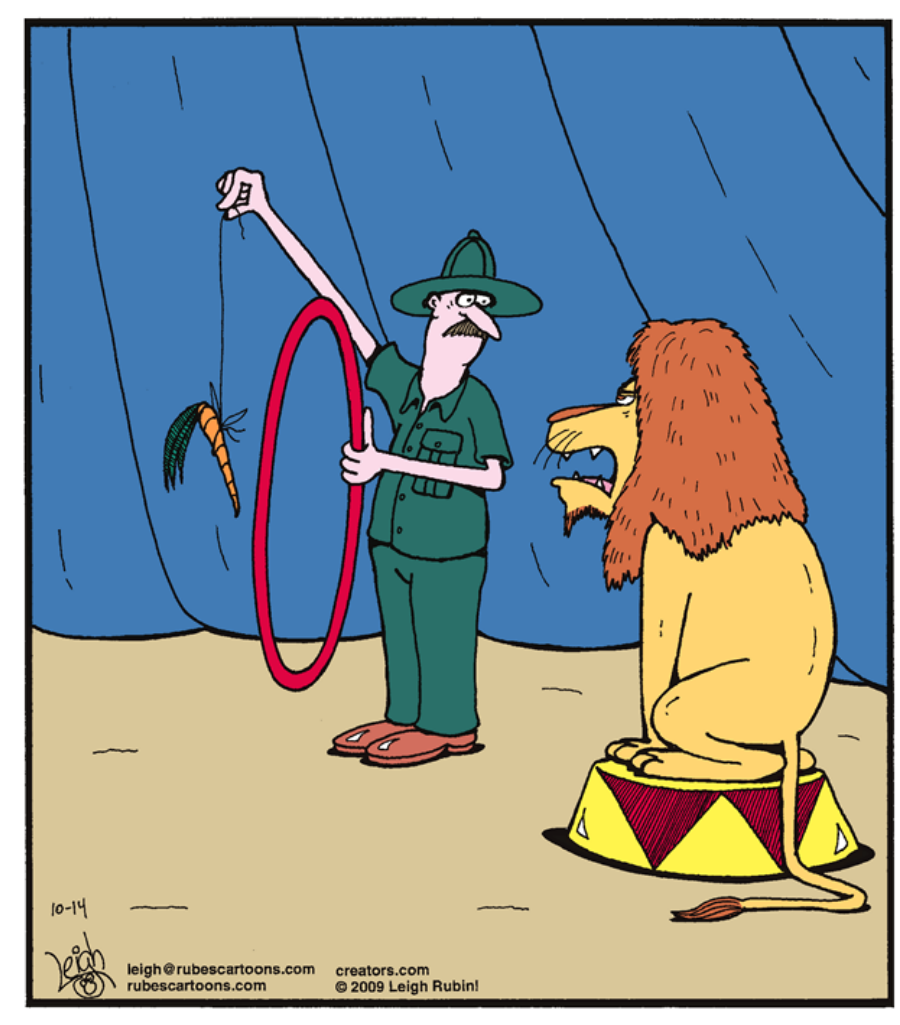
"Sorry, pal, right metaphor, wrong motivation."