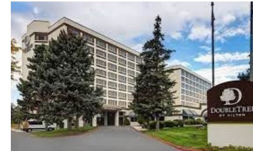
DoubleTree by Hilton Hotel Grand Junction, CO April 30, 2024