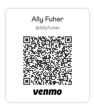
Scan this code to pay

last 4 digits of phone number are 7081). If the cost ends up being lower than anticipated, we will send you the difference back via Venmo after all jackets have been delivered.