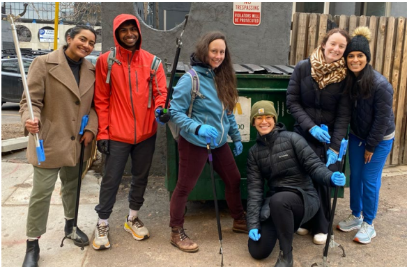
PC and Med-Peds Didactic Session